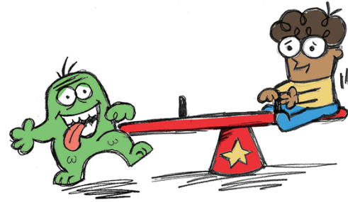
Pip and Pat sit.