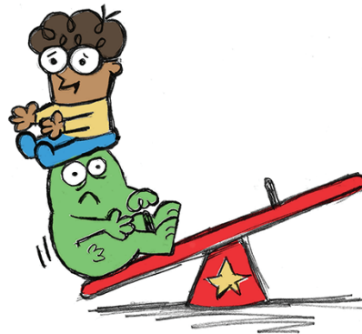
Pat is on Pip.