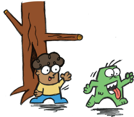
Go Pip go!