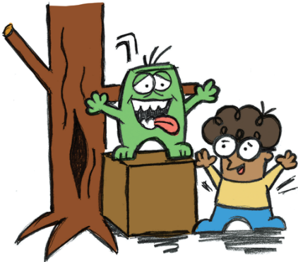
Pip gets down.