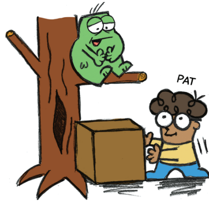
Pat gets a box.